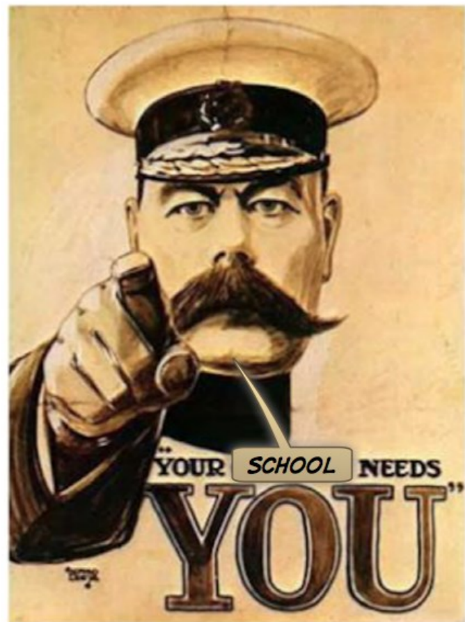
PICTON SCHOOL WHANAU AND COMMUNITY